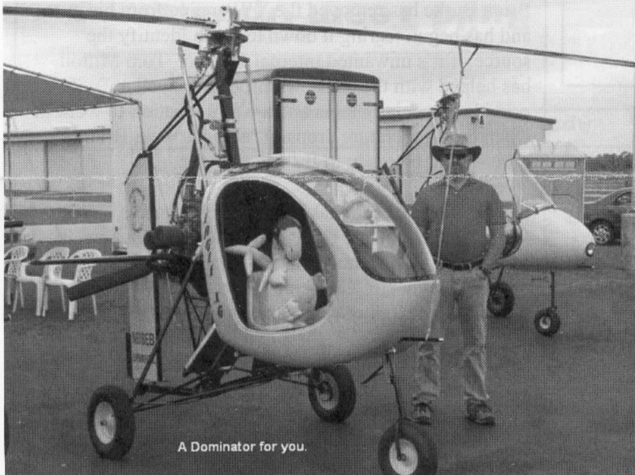
A Dominator for you.