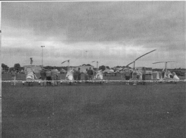
Magni gyros at Bensen Days 2009