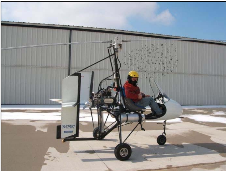
Matt Novotney pauses for a photo while fighting off a swarm of angry, potentially malaria-infested mosquitoes.