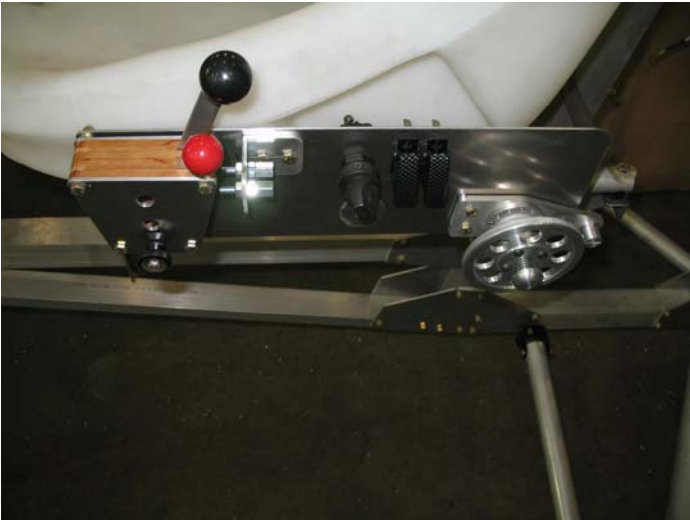
A close-up of Adam's throttle quadrant.