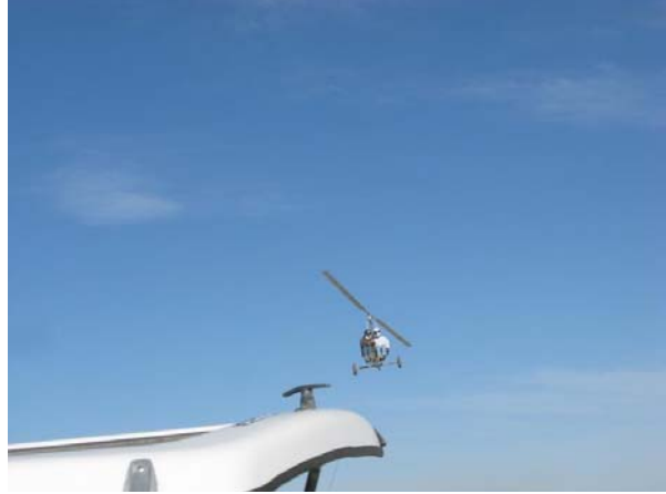
Glider in the air.