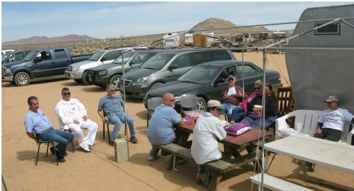
Meeting before lunch