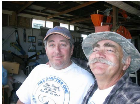
Two good looking ?