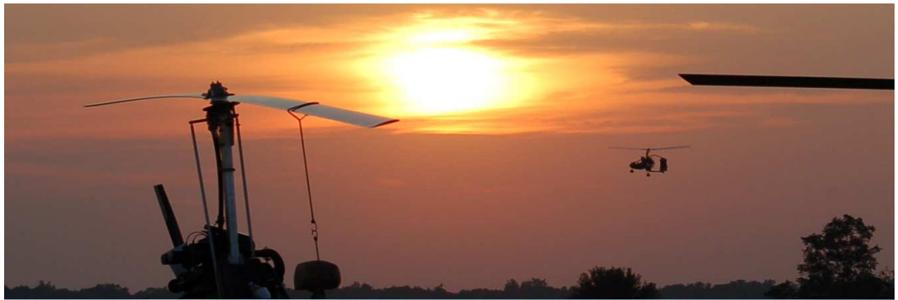
“30 Seconds over Grimes..” Page 2