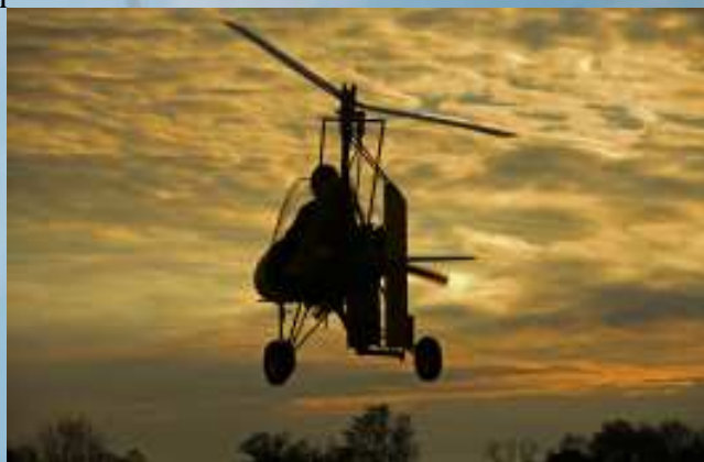
Doug's Winning Solo Photo